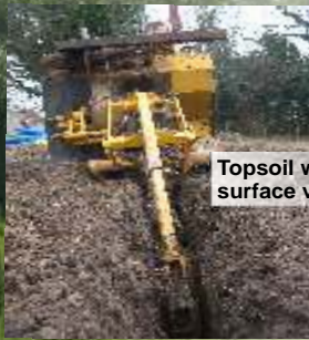
Topsoil with surface vegetation