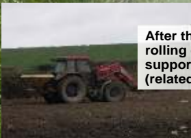
After the drainage system is placed, recultivation, grass seed, rolling or other processes are needed to re-establish water regime and support growth of biomass with desirable botanical characteristics (related to purpose of area)